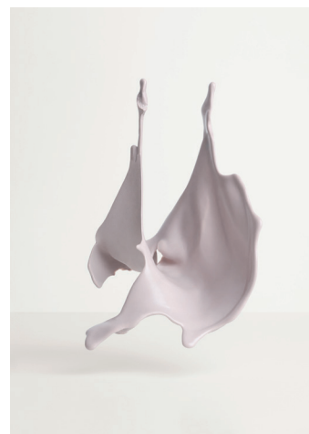
Afterbeauty series (2018)

Her next works are created from shots taken through long and exhausting performances involving the application of different materials on the face or body. These materials, including plaster, fabric, beauty masks and hot wax, charged with semantic content, generate unconventional self-portraits in the form of masks