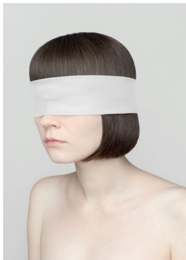
Post series (2013-2016)