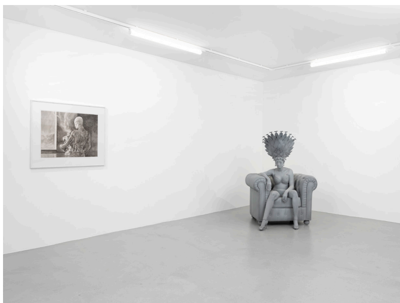
Hans Op de Beeck

Gowen gallery is delighted to continue its gallery program with a second exhibition in its new spaces at Grand-Rue 23. The collective show entitled Escape Line II - Drawings and Sculptures gathers seven contemporary artists for whom drawing is at the centre of their artistic expression, although several pursue multidisciplinary practices. In addition to drawing, sculpture is, for some of them, a particularly coherent part of their visual language. The show focuses on the creation of imaginary universes that often transport the spectator to parallel worlds as its meeting point. The exhibition includes works from private collections.