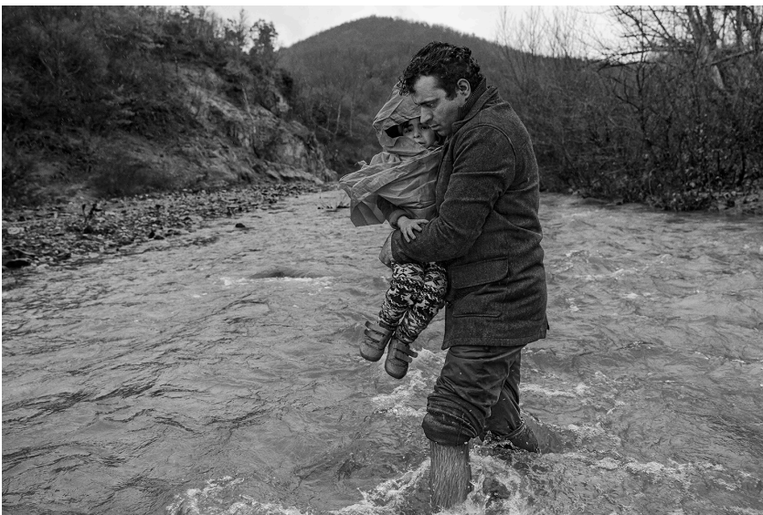
James Nachtwey, Greece, Idomeni , 2015, Archival pigment print, cotton fiber paper