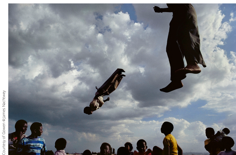
James Nachtwey, South Africa, Soweto , 1992, Archival pigment print, cotton fiber paper

He has had numerous solo exhibitions worldwide, including the International Center of Photography in New York, Maison Européenne de la Photographie in Paris, Palazzo Reale in Milan, El Círculo de Bellas Artes in Madrid, Bibliothèque nationale de France in Paris, Foam Fotografiemuseum in Amsterdam, Museum of Photographic Arts in San Diego, Fotografiska in Stockholm, New York (currently on view) and Tallinn, Palazzo delle Esposizioni in Rome, Karolinum in Prague, the Hasselblad Center in Göteborg, Sweden, Fondazione Palazzo Magnani in Reggio Emilia, Italy and C/O Berlin, among others.