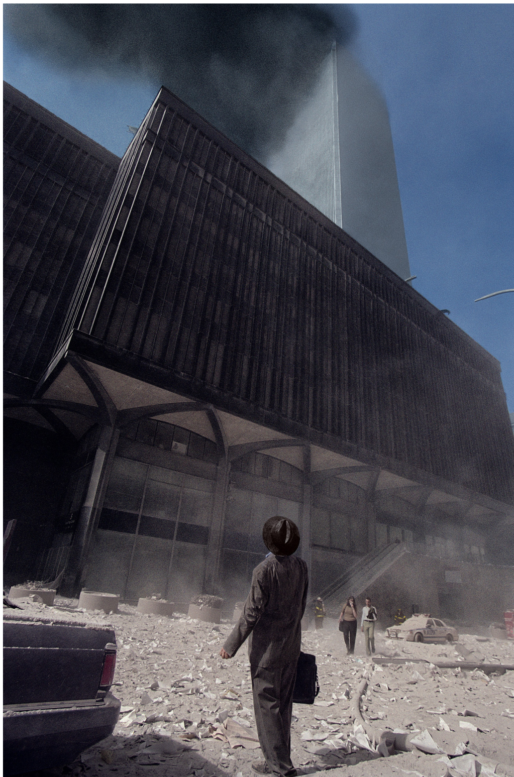
James Nachtwey, USA, New York City , 2001, Archival pigment print, cotton fiber paper