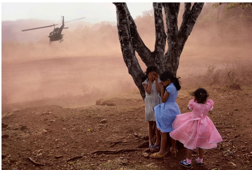
James Nachtwey, El Salvador, San Luis de la Reina , 1984, Archival pigment print, cotton fiber paper