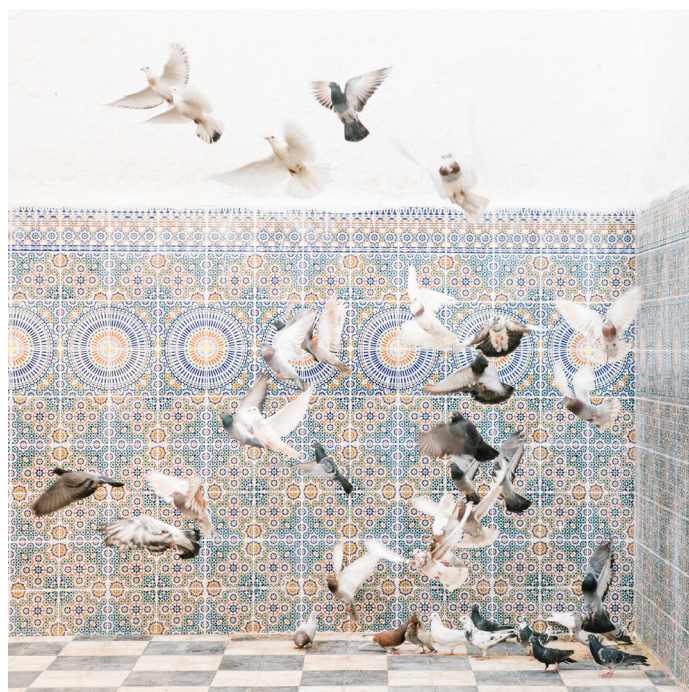
M'hammed Kilito, Aves Pacis , 80 x 80 cm, ed. of 5 + 2 AP, 2018

For the 10th anniversary edition of Photo Basel, GOWEN gallery is delighted to show a group of three Moroccan visual artists working on long-term projects and who each use their photographic practice as a means of storytelling. Aware of the rise of a fast, sometimes incomplete global media landscape, the KOZ collective, consisting of M'hammed Kilito , Imane Djamil and Seif Kousmate focuses on a hybrid and research-based work. To complete the presentation, the booth includes an image by American photojournalist and war photographer James Nachtwey .