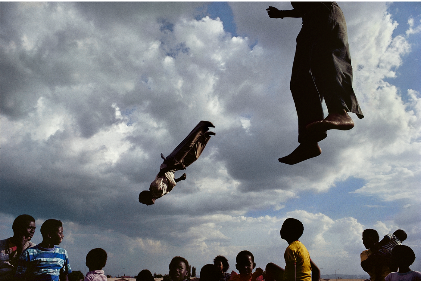
James Nachtwey, South Africa, Soweto, 76.2 x 101.6 cm, 1992.