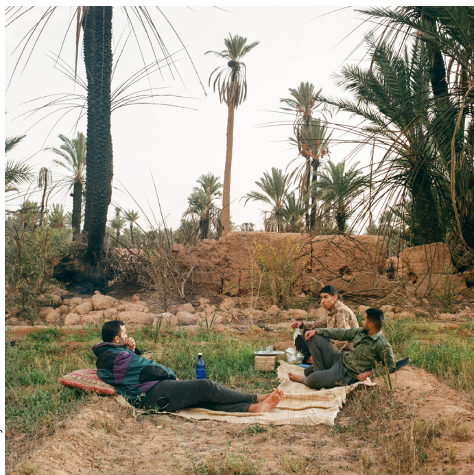
M'hammed Kilito, Picnic on the grass , Tighmert oasis, Morocco, 100 x 100 cm, ed. of 5 + 2 AP, 2022.

Courtesy of the Artist and GOWEN. © M'hammed Kilito