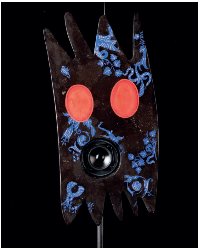
Yuval Avital, Leviatano n.5 , 2019, marble stucco, 70 x 30 x 10 cm

In today's language, the term 'chimera' is also used to designate a utopia, something unattainable, a desire, which is, perhaps, the vector that brings to life a work of art.