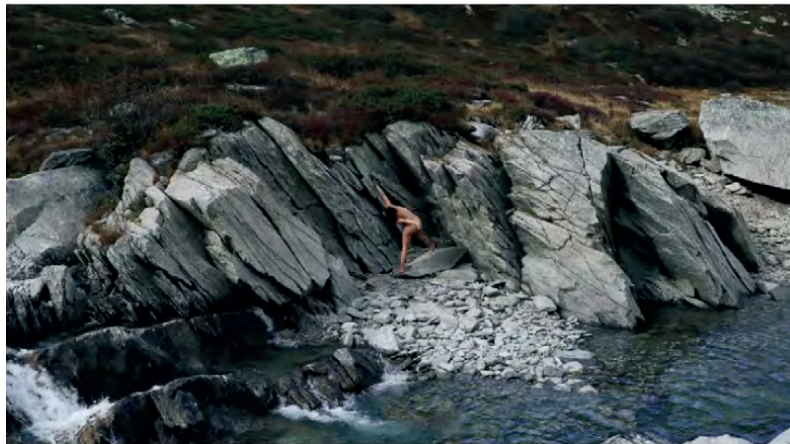
Yuval Avital, Foreign Bodies n.1/Icon-sonic episode n.33 , video, audio

Song of the Chimeras by Yuval Avital is the third exhibition at the gallery's new space at Grand-Rue 23 in Geneva. This is the artist's first solo presentation with Gowen.