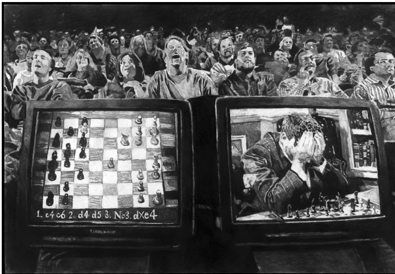
Étude pour un portrait de Pierre-François #64, 2023 charcoal and graphite on paper 75 x 110 cm 29.5 x 43.3 in JZ 08