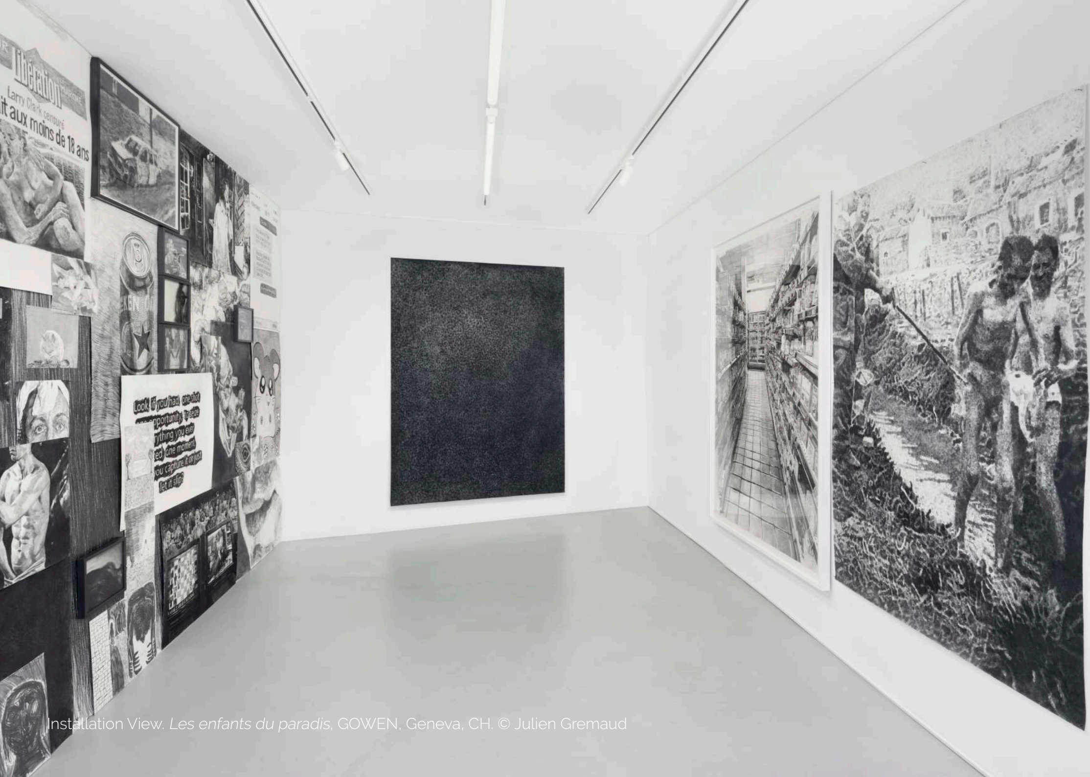
Installation View. Les enfants du paradis , GOWEN, Geneva, CH.