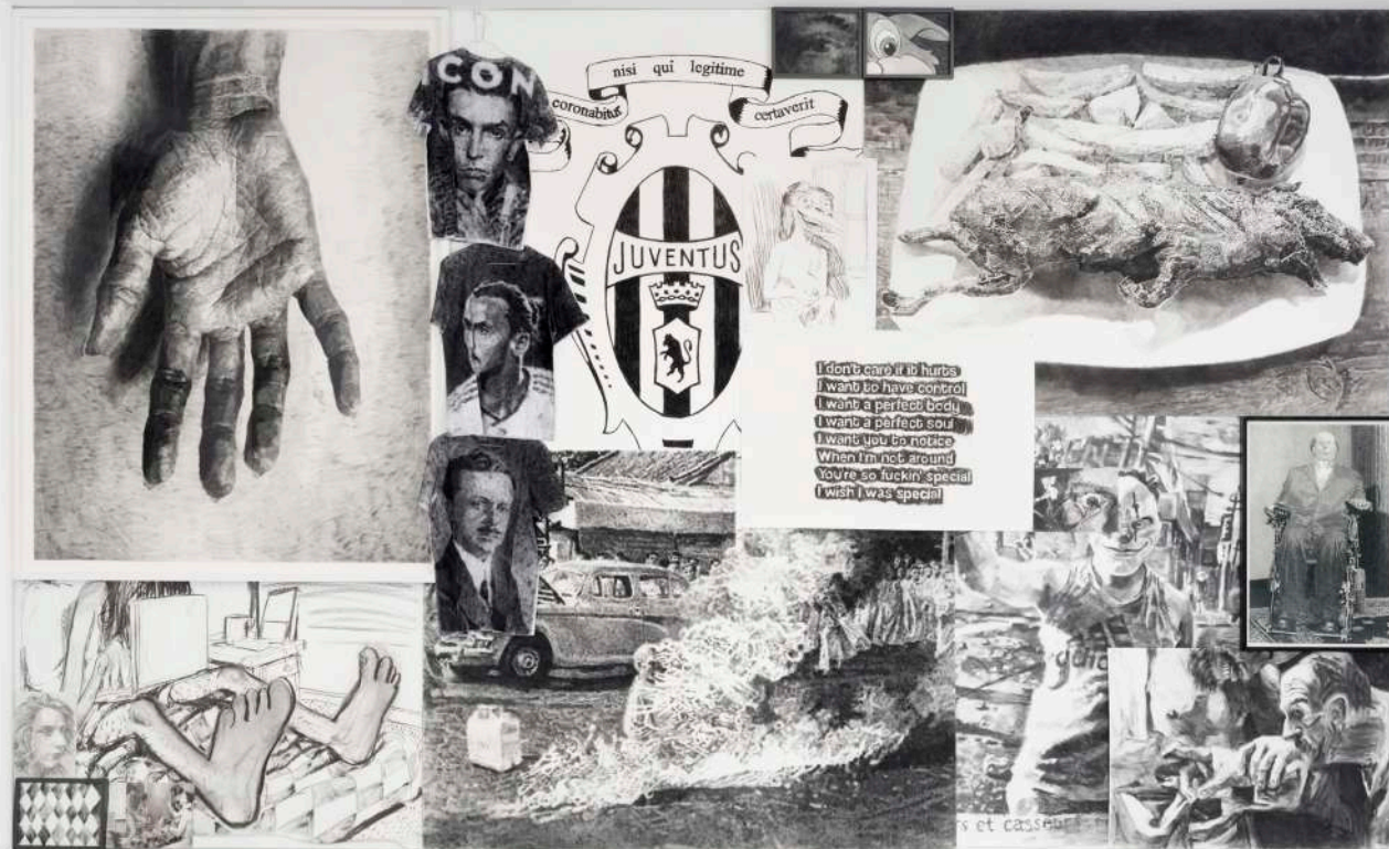
Installation View. Les enfants du paradis , GOWEN, Geneva, CH.