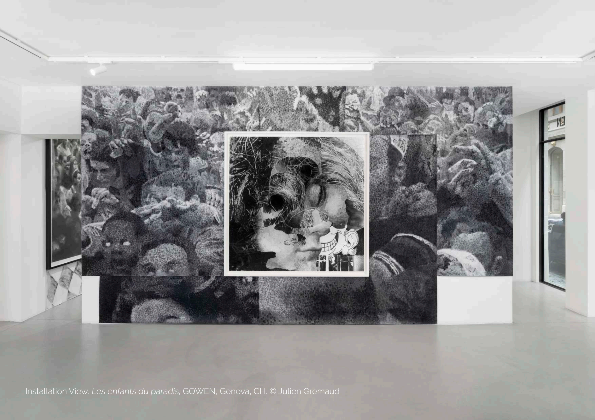
Installation View. Les enfants du paradis , GOWEN, Geneva, CH.