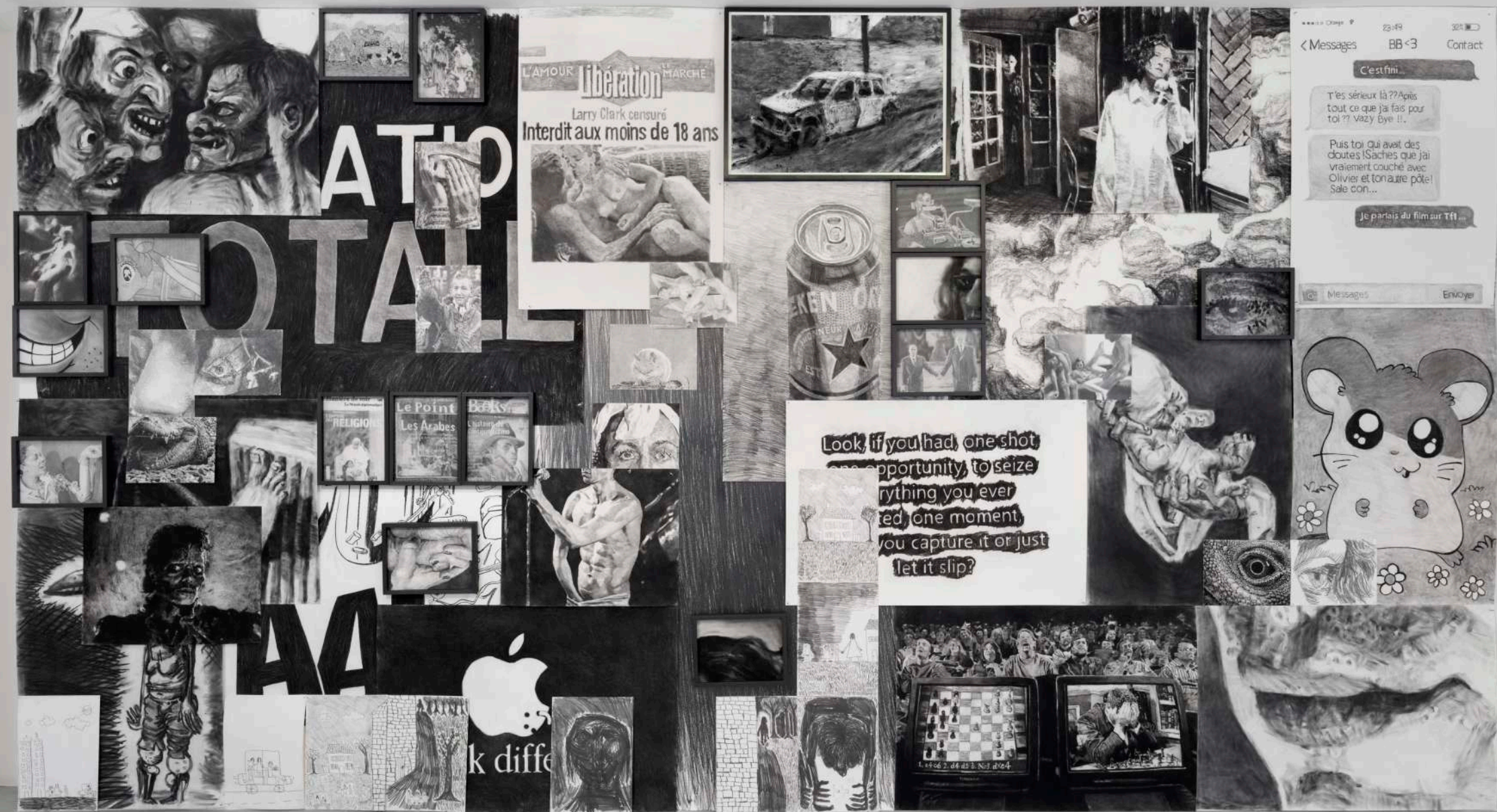
Installation View. Les enfants du paradis , GOWEN, Geneva, CH.