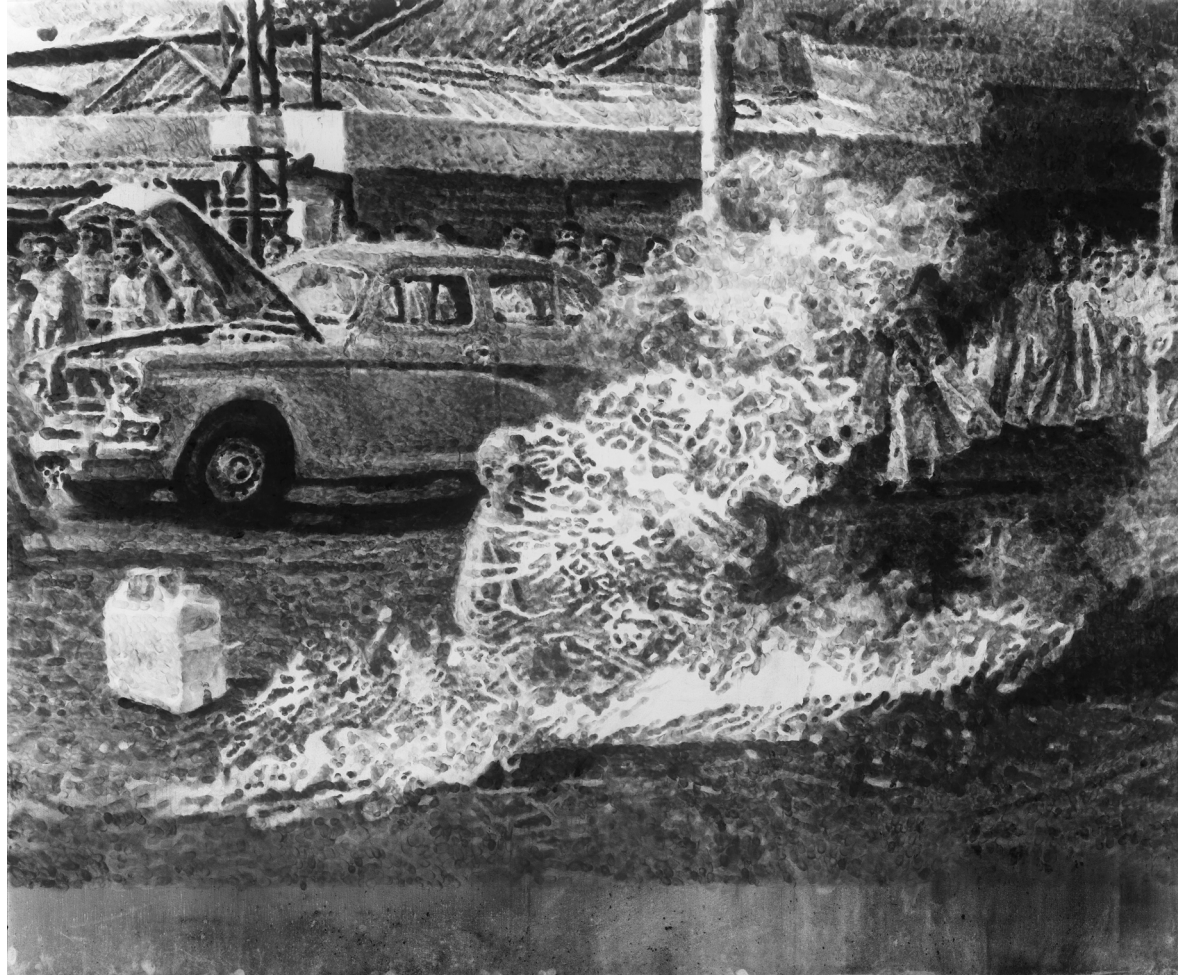
Étude pour un portrait de Pierre-François #46, 2023 charcoal and graphite on paper 150 x 200 cm 59.1 x 78.7 in JZ 05