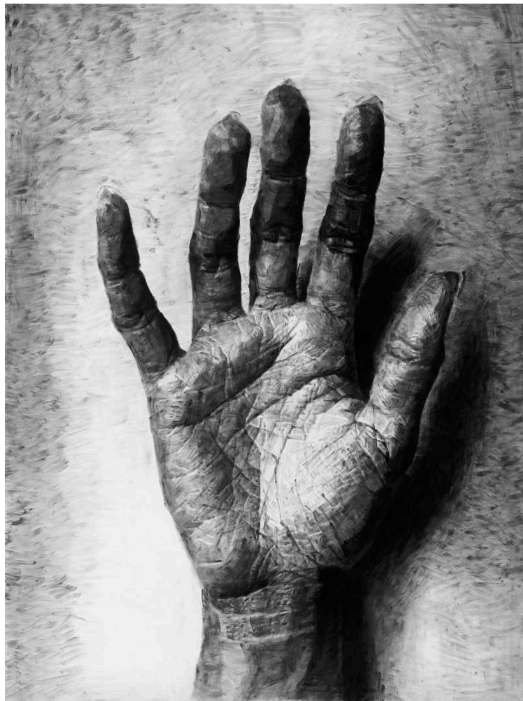
Portrait de Main #5 , 2019 Graphite and charcoal on paper 200 x 150 cm 78.7 x 59.1 in Framed : 206 x 156 cm JZ 36