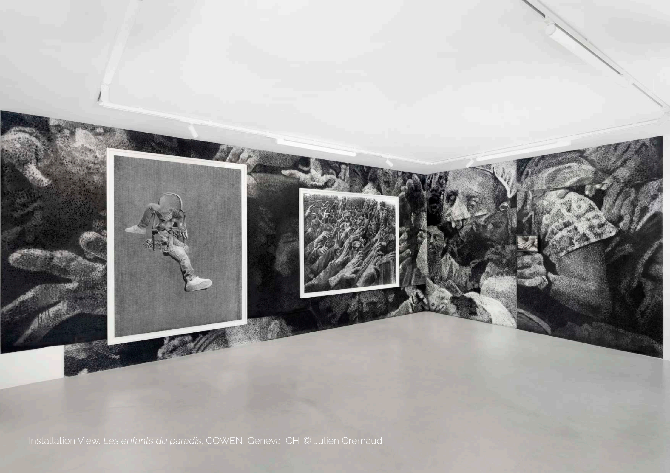
Installation View. Les enfants du paradis , GOWEN, Geneva, CH.