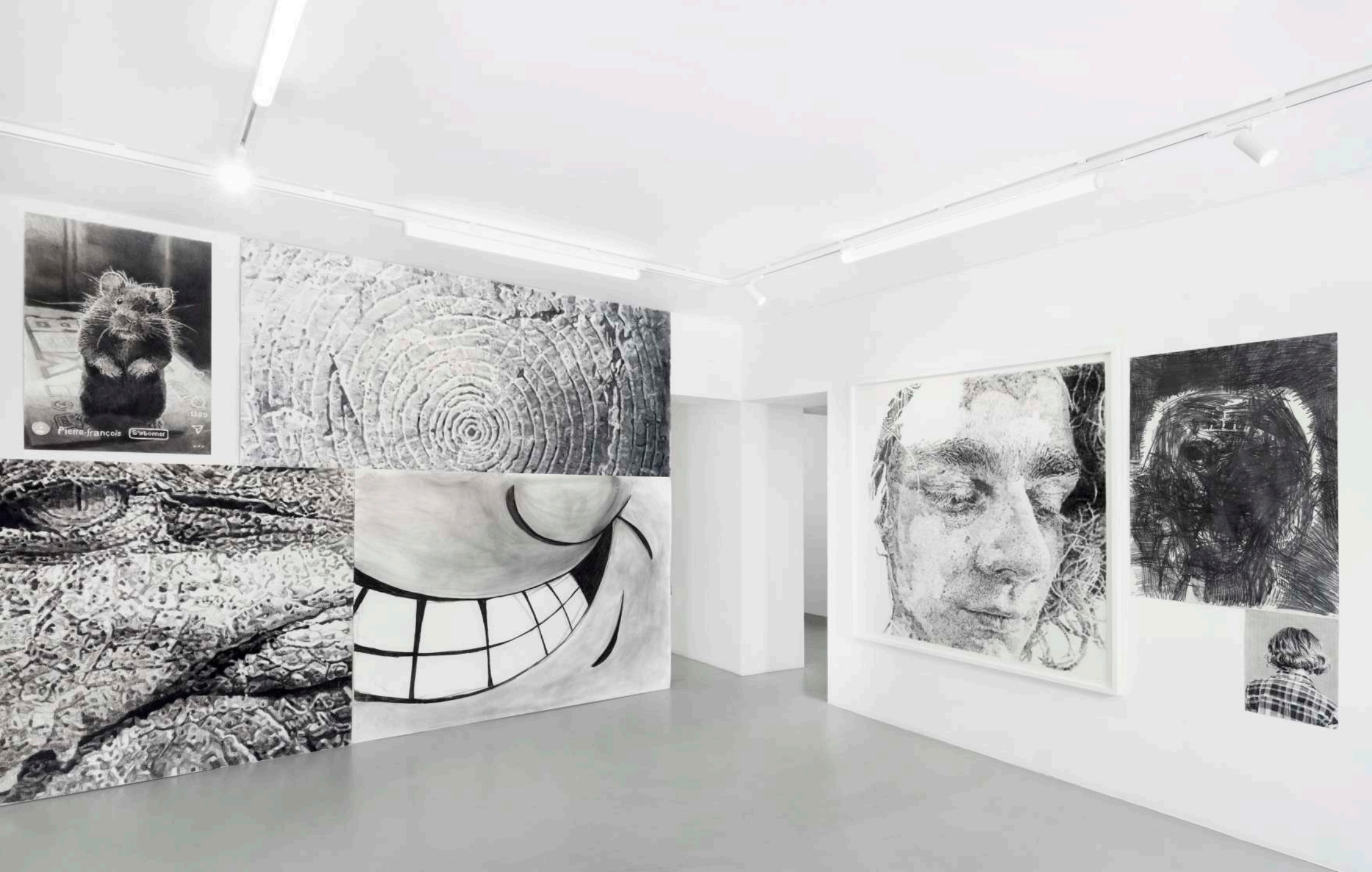
Installation View. Les enfants du paradis , GOWEN, Geneva, CH.