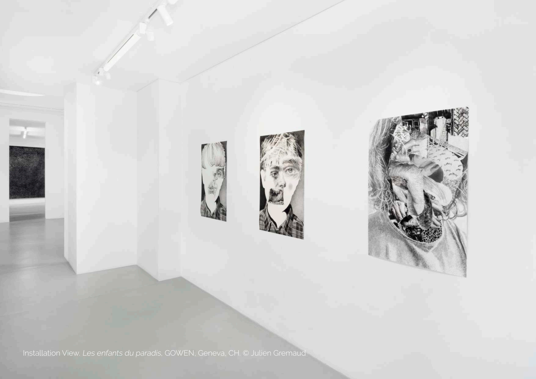
Installation View. Les enfants du paradis , GOWEN, Geneva, CH.