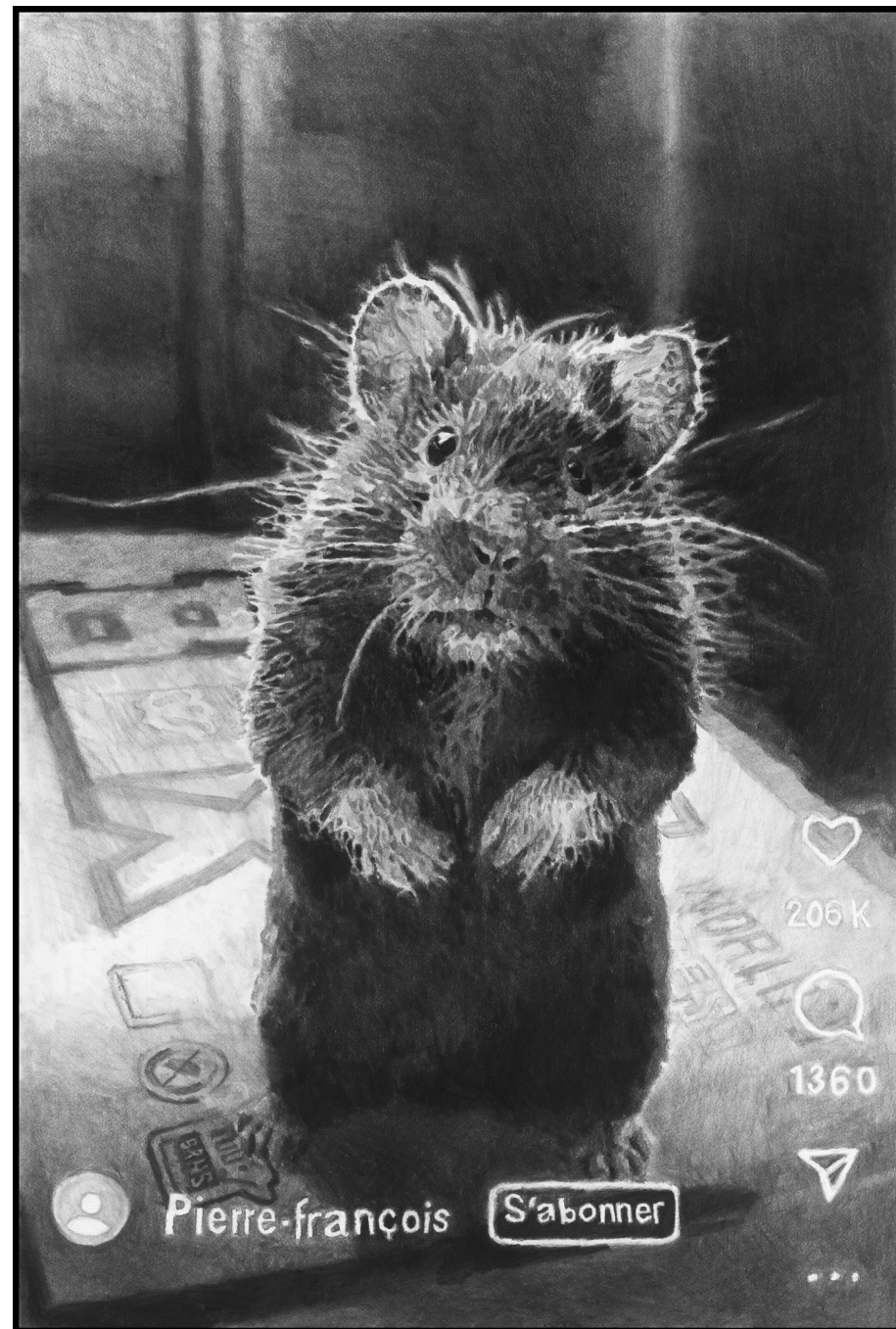
Étude pour un portrait de Pierre-François #50, 2023 charcoal and graphite on paper 110 x 75 cm 43.3 x 29.5 in JZ 06