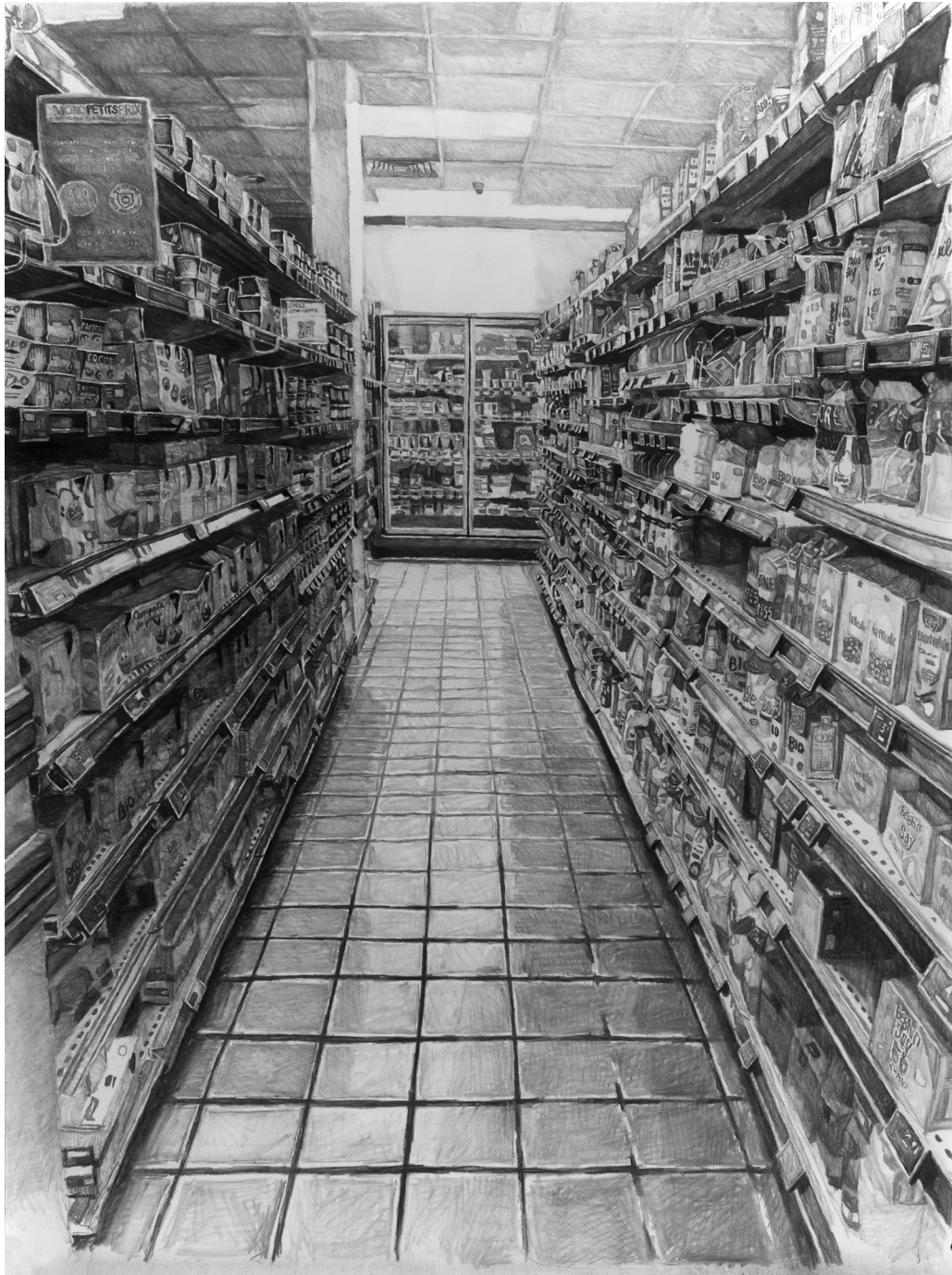
Étude pour un portrait de Pierre-François #50, 2023 charcoal and graphite on paper 200 x 150 cm 78.7 x 59.1 in Framed: 214.5 x 164.5 cm JZ 07